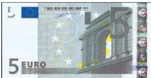
Note of 5 Euro Motif of Robert Kalina

Classical art can be classified in three main styles: Ionic, Doric and Corinthian. It was born in Greece and was handed down to Rome. The contrast between the styles is elaborated to create an aesthetic effect. The buildings, the Propylaea, are the monumental doors found in ancient Greek temples and were usually made of white marble. The architectural forms such as the friezes and mouldings are painted in lively colours.